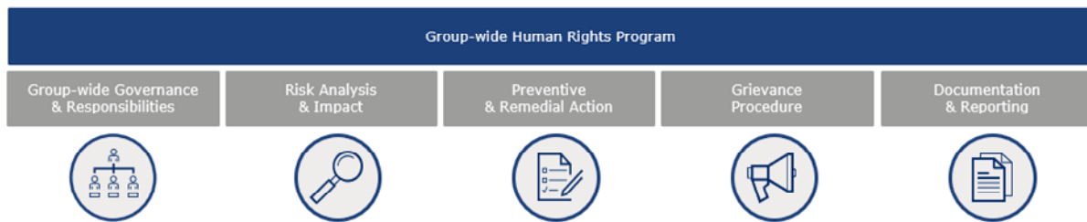
Graphic 1: The five building blocks of our Human Rights Program

Our human rights due diligence – for our own operations and supply chains – is based on five building blocks: